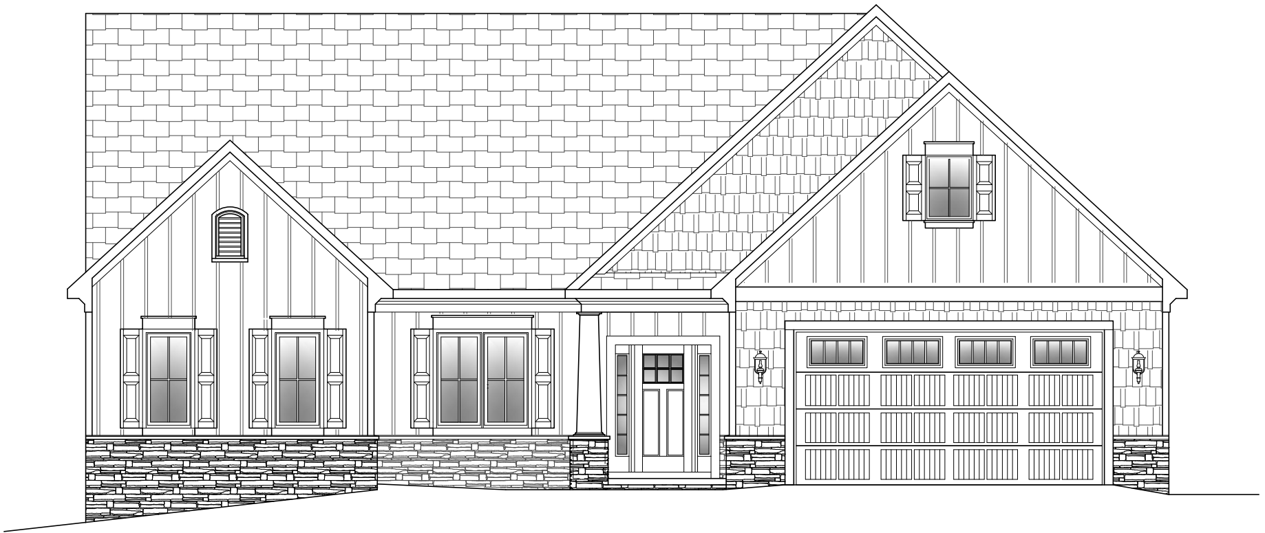
AFTON FRONT ELEVATION