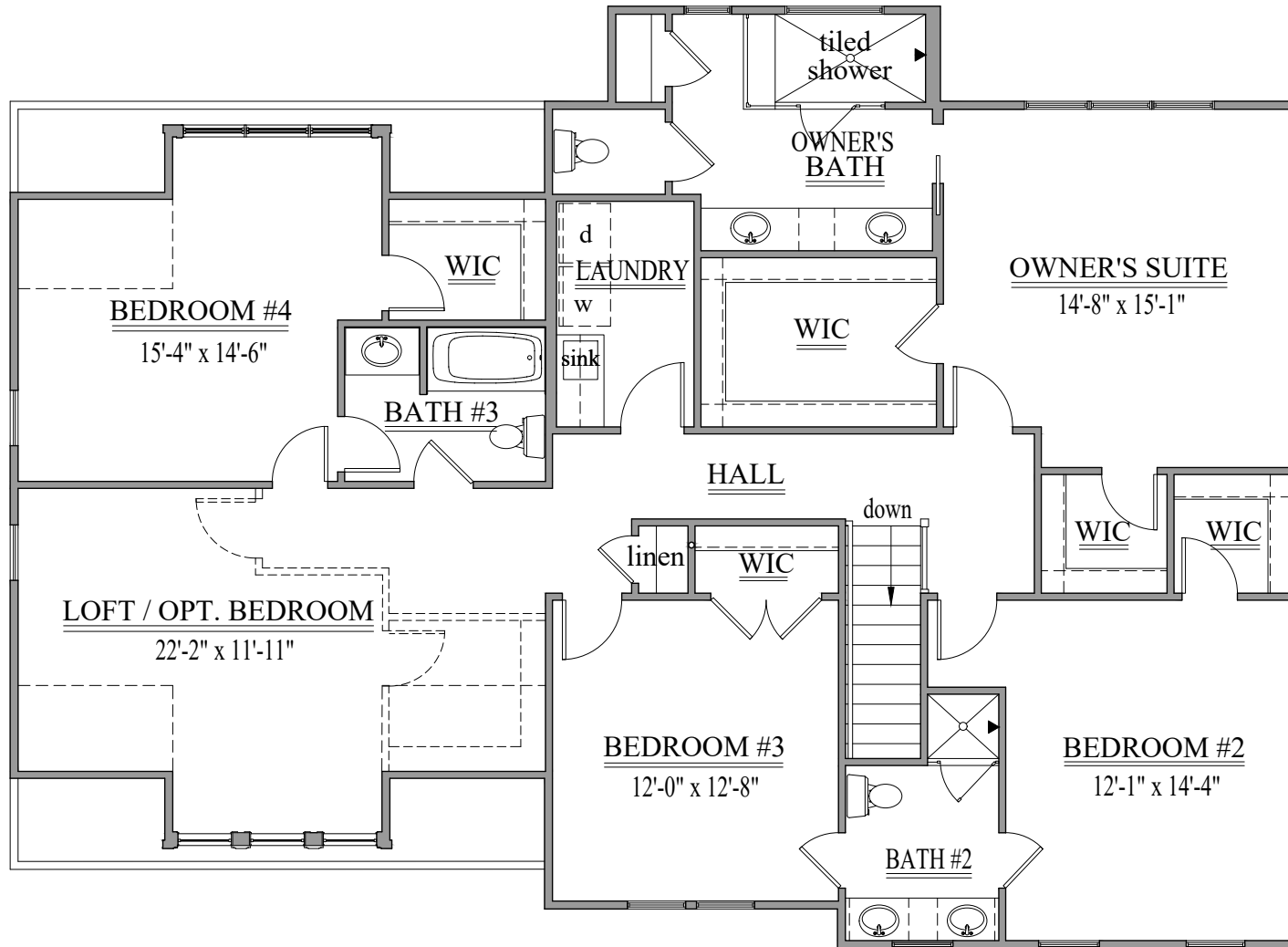
FINCASTLE SECOND FLOOR PLAN 1780 s.f.