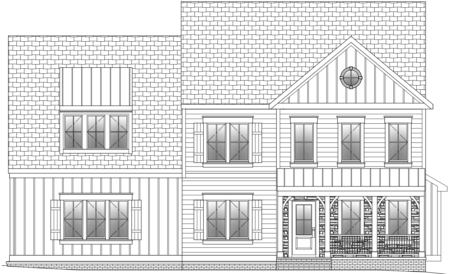
FINCASTLE FRONT ELEVATION