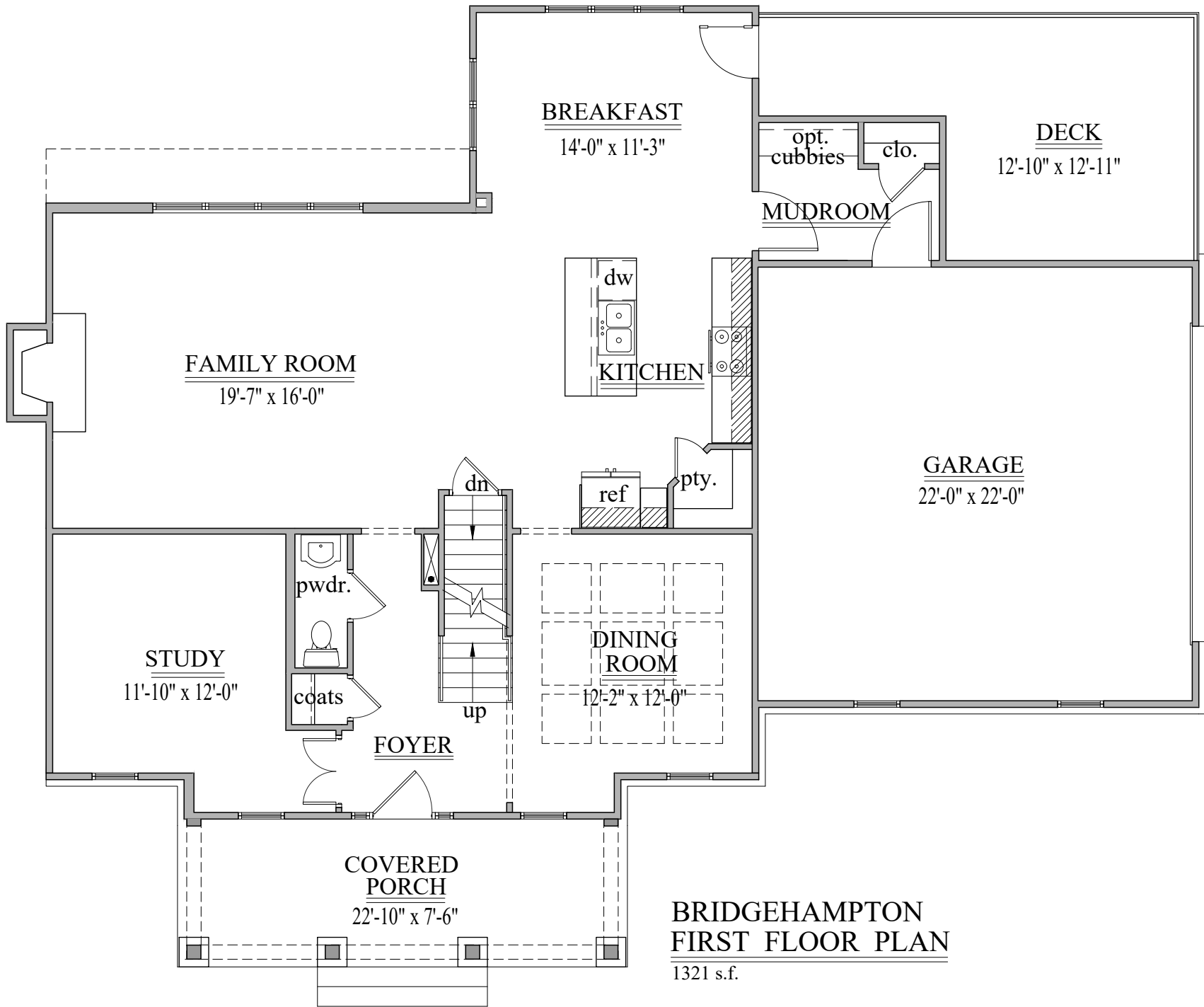
BRIDGEHAMPTON FIRST FLOOR PLAN 1321 s.f.