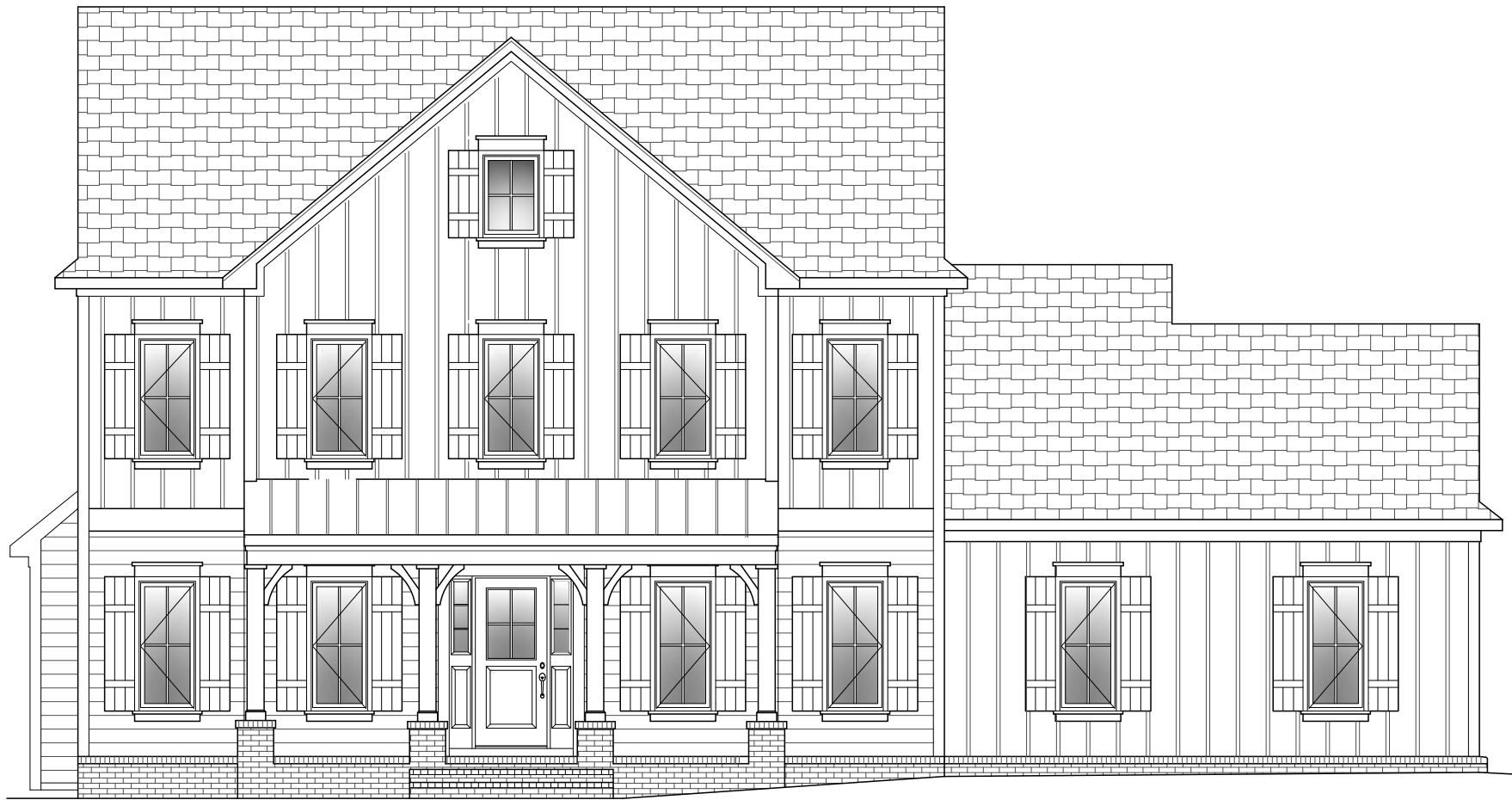
BRIDGEHAMPTON FRONT ELEVATION