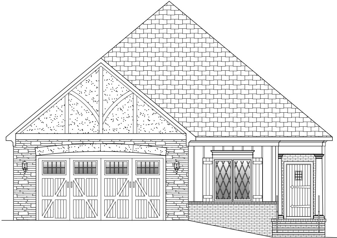
ASHMERE FRONT ELEVATION