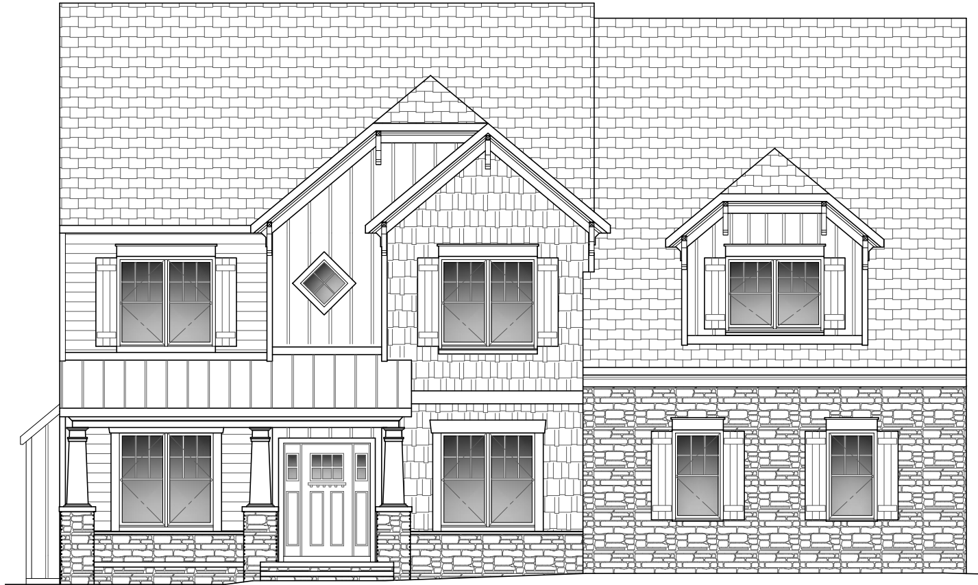
WYNDHAM FRONT ELEVATION