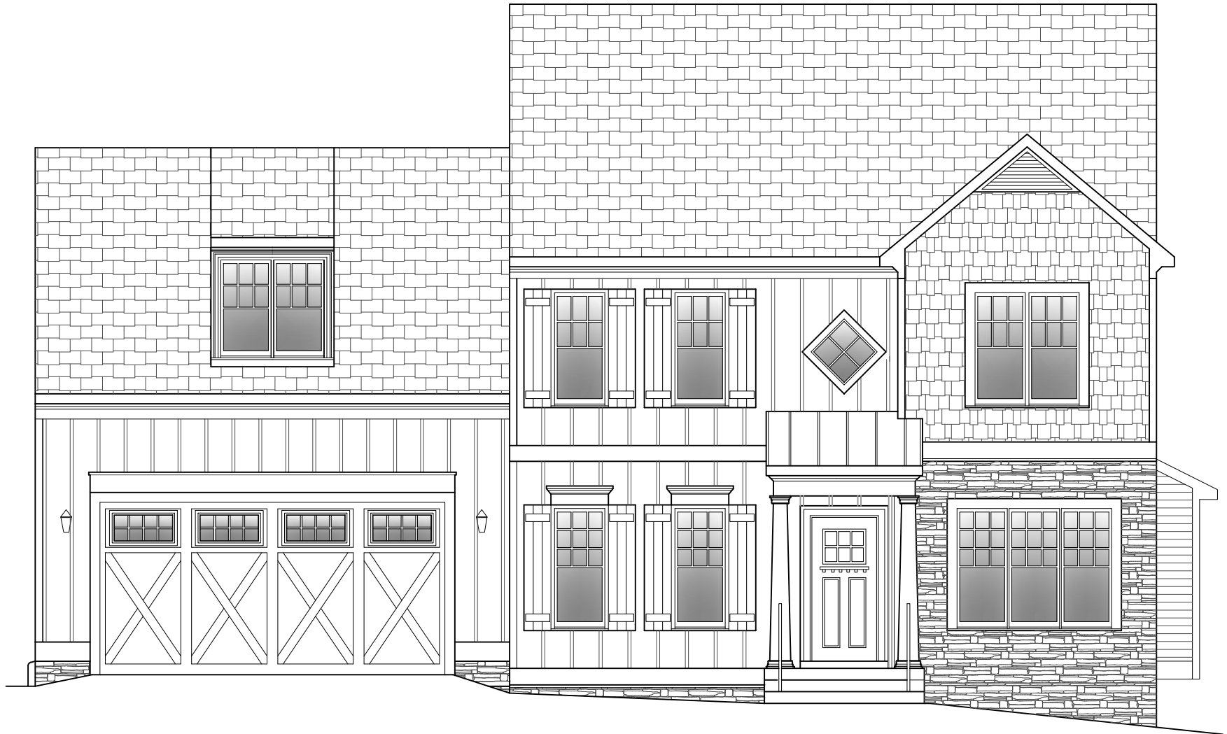
STANBRIDGE FRONT ELEVATION