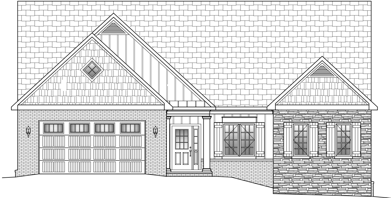
"KENTMERE" FRONT ELEVATION