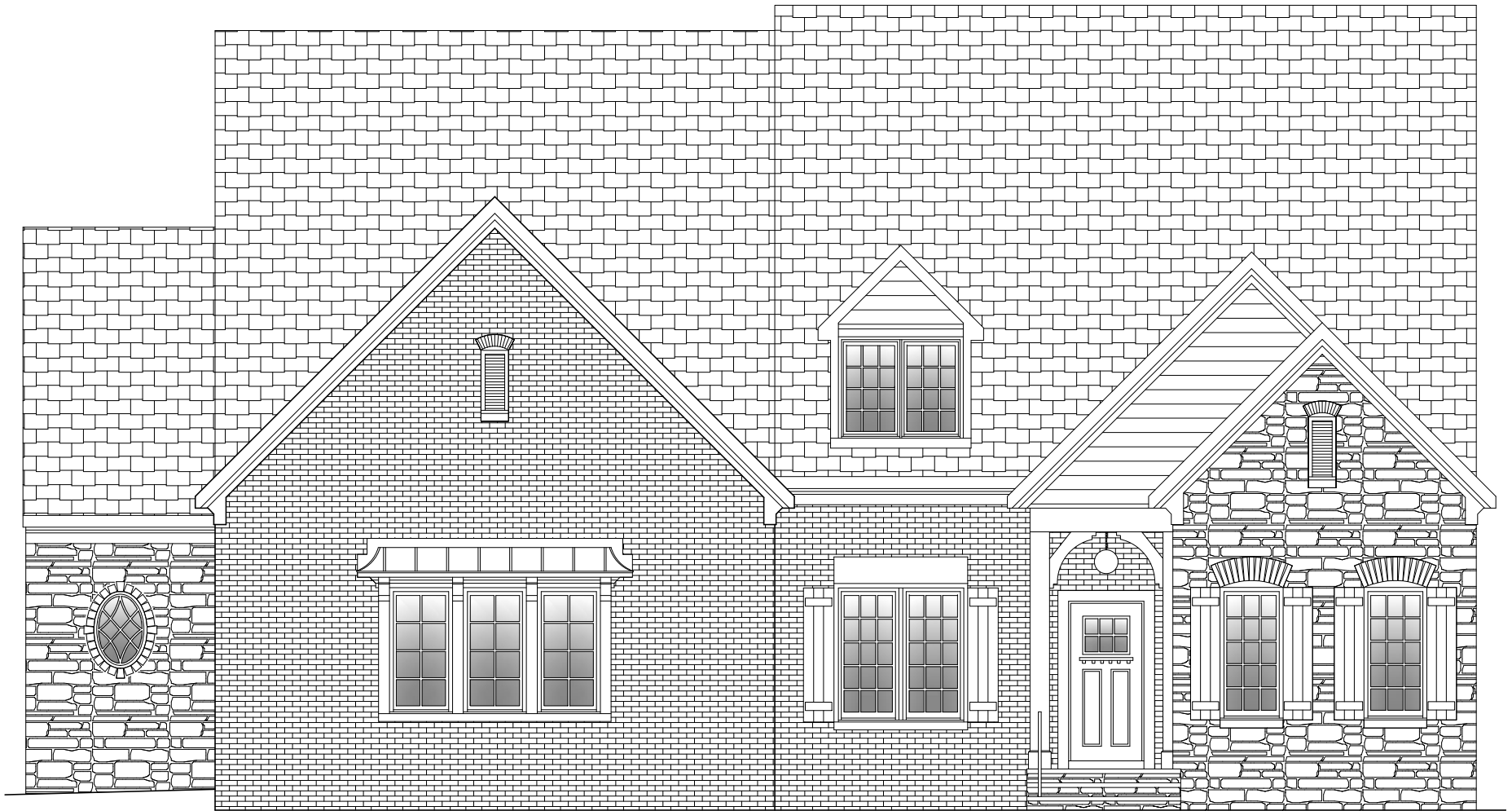
STREMOOR FRONT ELEVATION