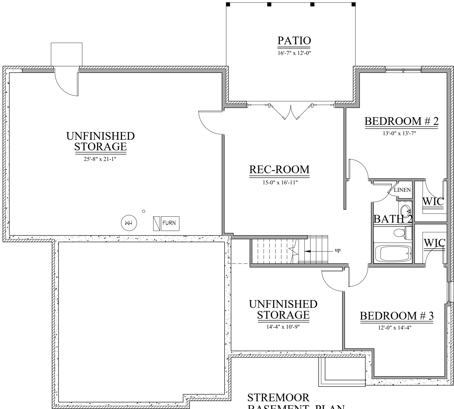
STREMOOR BASEMENT PLAN OPTION 2 891 S.F. FINISHED