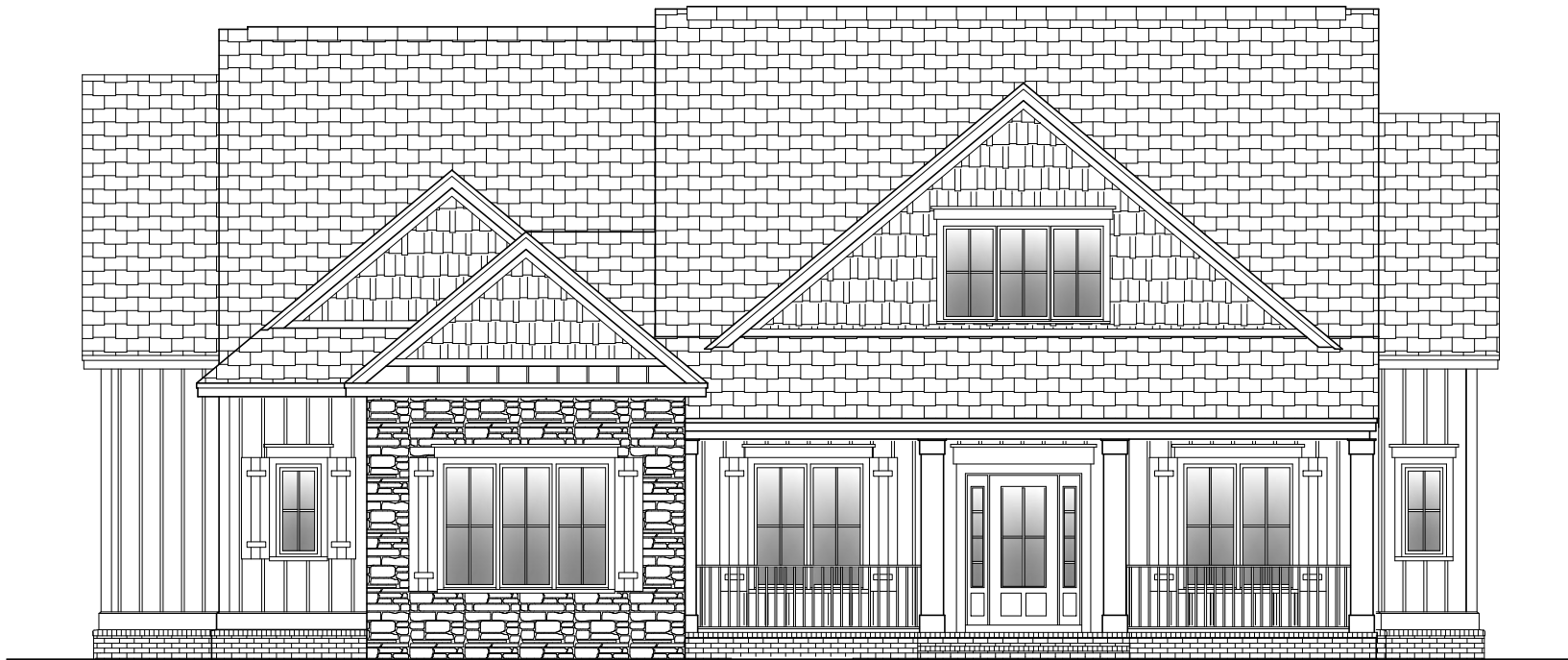
RIDGELINE FRONT ELEVATION