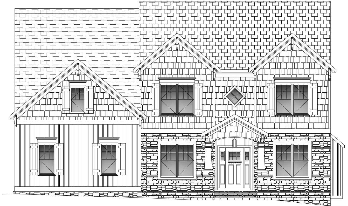
DOVERCROFT "A" FRONT ELEVATION