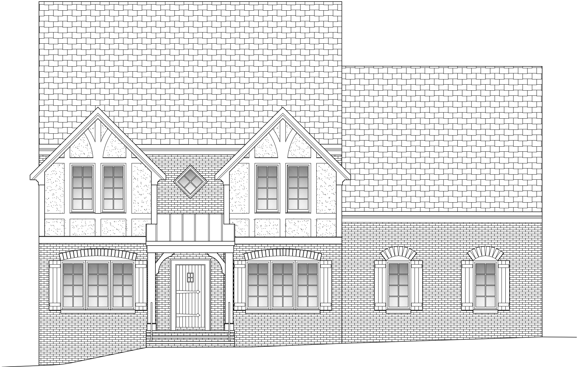
BLAKESHIRE FRONT ELEVATION