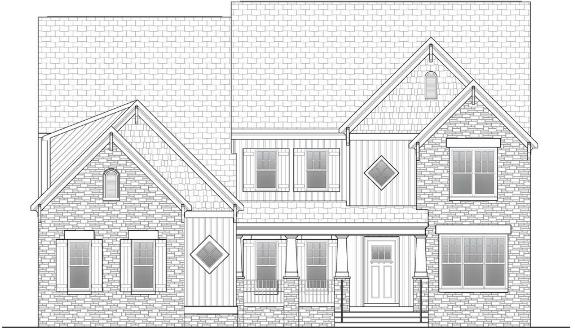
OXBRIDGE FRONT ELEVATION "C"