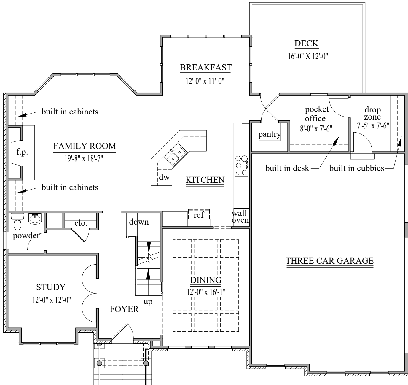
KINGHAM FIRST FLOOR PLAN 1517 s.f.