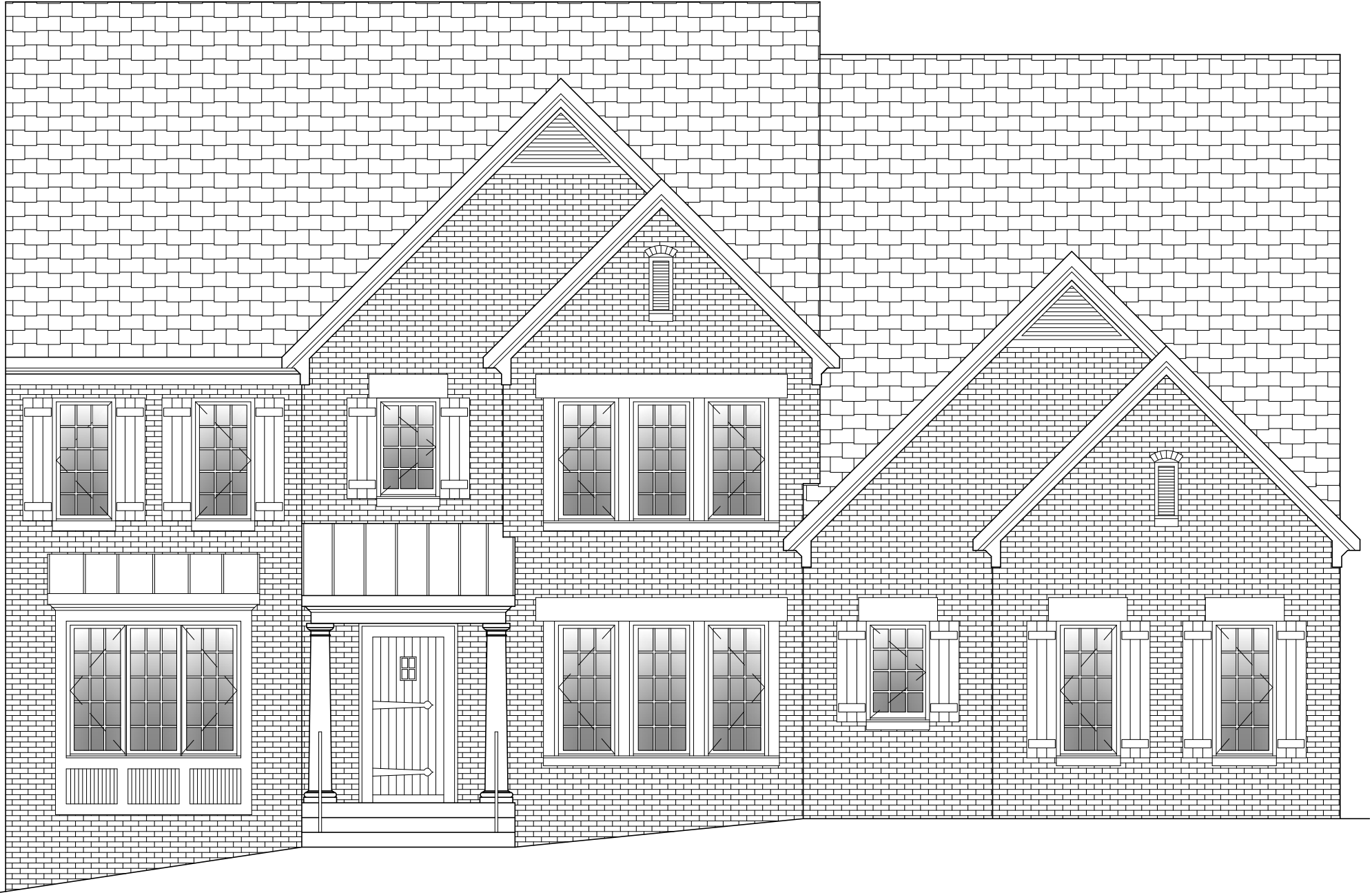
KINGHAM FRONT ELEVATION