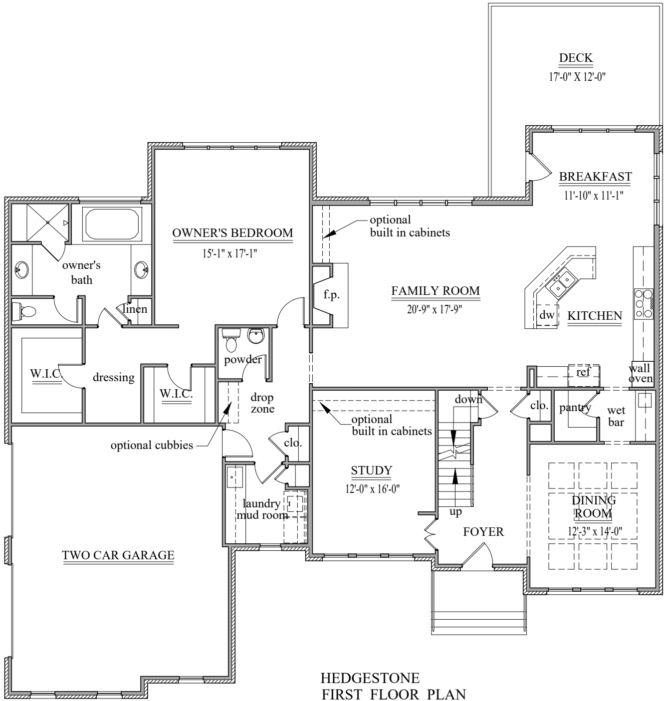
HEDGESTONE FIRST FLOOR PLAN 2181 s.f.