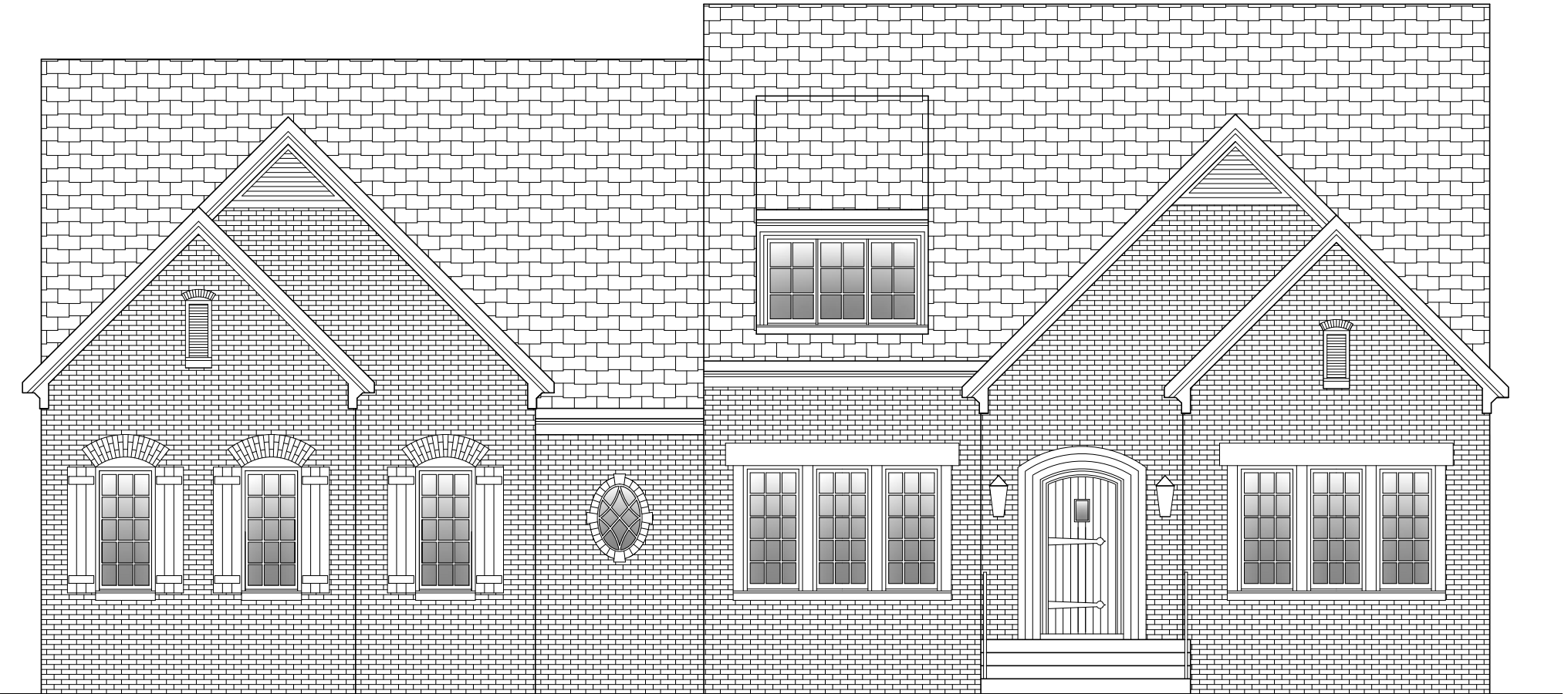
HEDGESTONE FRONT ELEVATION